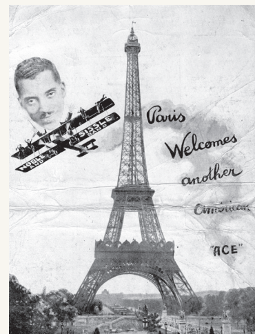
Paris Welcomes Another American "Ace"

After Europe's tragic death later that same year, his music left a long-lasting and global impression. Rafael Hernández, a trombonist in the band, became one of the most influential Latin American composers to date. The regiment band went on to tour nationally and their music defined the parameters for what became known as the Harlem Renaissance movement.