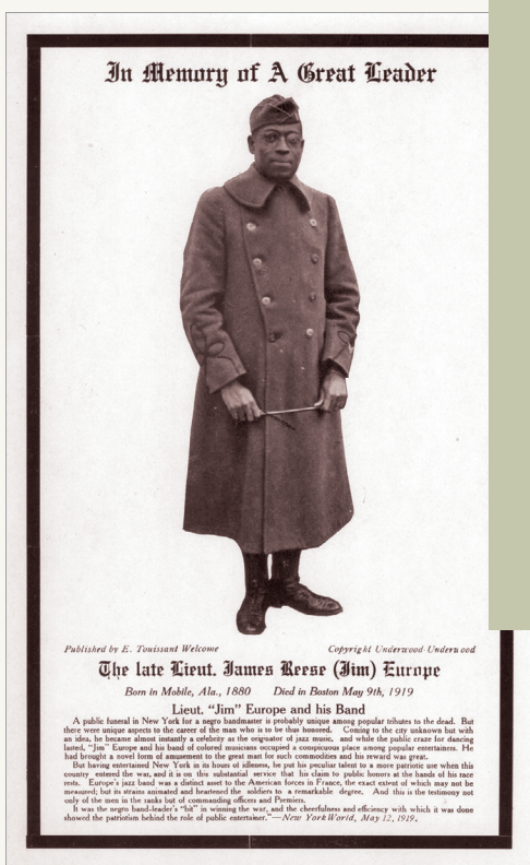
James Reese Europe Memorial Announcement.

The confidence displayed by the regiment and band as they marched into Harlem inspired a larger movement of music, art, and pride in the African American community.