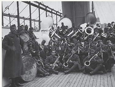
James Reese Europe and his band, 1919.